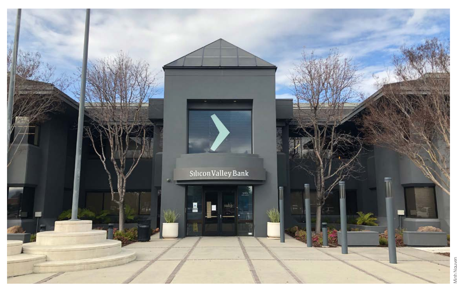
The Santa Clara headquarters of SVB.

passage of 100 years makes it understandable that SVB executives initially failed to grasp the situation, but their dismissal of the Fed's warnings is less excusable. In early 2022, the Fed clearly signaled its commitment to a much more aggressive monetary policy, often referencing the tragic errors that led to the Great Inflation of 1965-1982. SVB failed to heed these warnings. Instead, SVB locked in low rates on a significant portion of its loan portfolio by investing in long-term, low-yielding fixedrate Treasury bonds, while removing interest rate hedges designed to protect against rising interest rates.